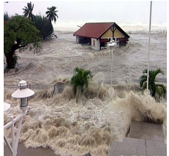
Waves from Cyclone Meena lash the Courthouse steps in Rarotonga, swamping a fast food establishment in Avarua Harbor. Stronger weather events are one of many effects of global warming and climate change in the Pacific.

Third, there is a shift in rainfall and weather patterns. According to Cook Islands Meteorological Service, the average temperature is increasing by about a degree, so seasons will be longer, hotter, and drier. Some islands are receiving more rainfall than usual, while others, such as Penrhyn, are experiencing drought. “If you don’t get the seasonal rainfall, or the cycles are out of whack, you could have empty water tanks,” said Carruthers. Storm surge damage also will increase. Planters are noticing changes in growing seasons and are researching ways to make plants more adaptable to heat, drought, and higher rainfall. Food security is a definite issue.