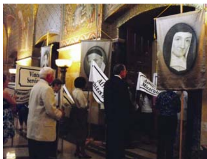
Members representing the 13 branches of the Vincenian Family assemble for the Entrance Procession.