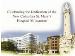
Celebrating the Dedication of the New Columbia St. Mary's Hospital Milwaukee